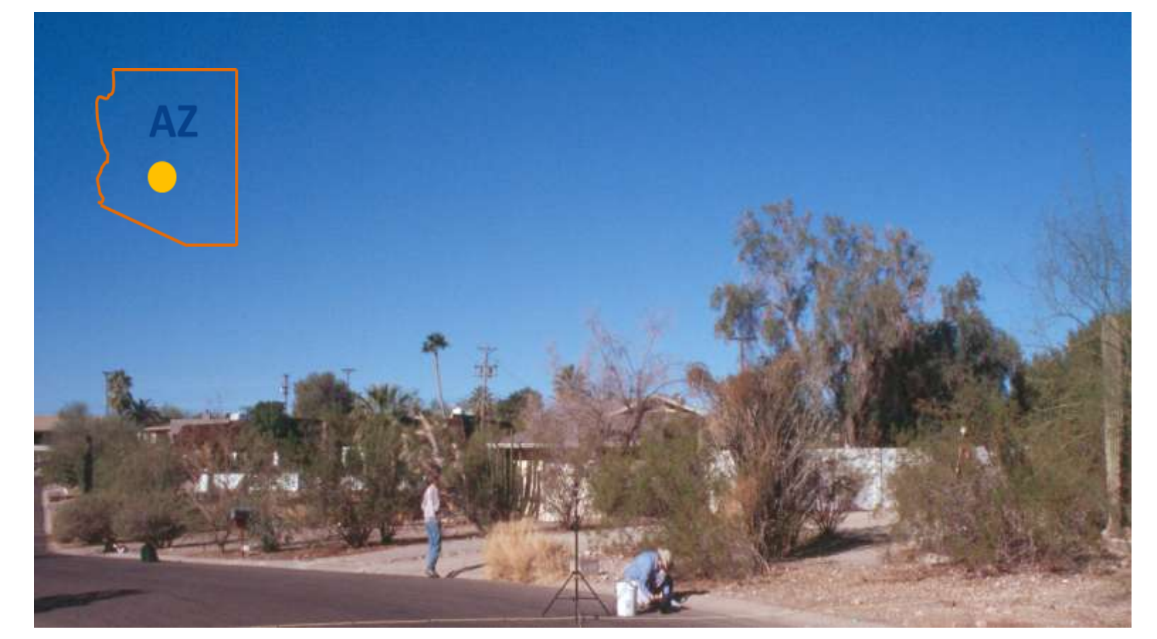
Fig 1. Soil samples were collected from 3 trees nearest plot-center from 46 urban sites and 13 desert (nonurban) sites.