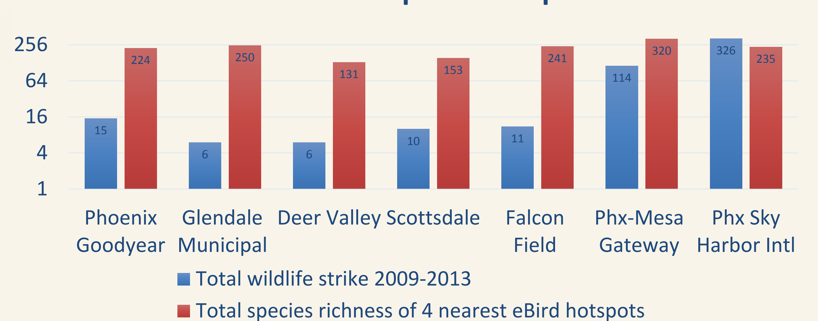
Figure 2: Graph of species richness compared to number of airport operations