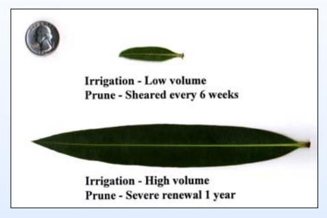
Figure 1 Comparison of leaves of Nerium showing two extremes in leaf area