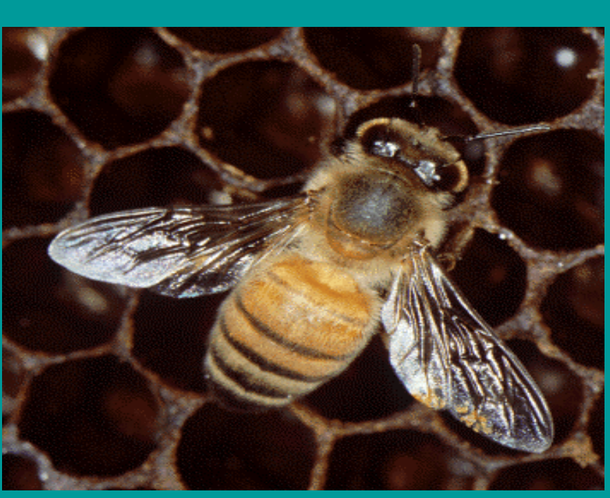
Honeybee ( Apis mellifera )