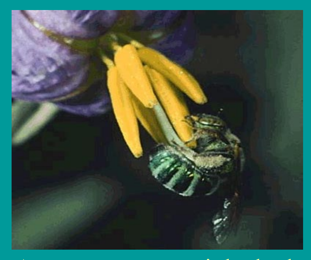
Agapostemon on nightshade