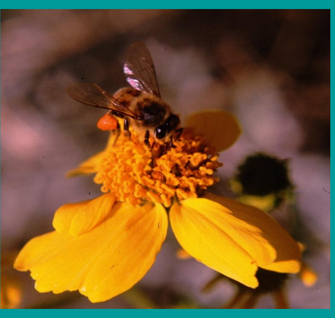
Apis mellifera on brittlebush