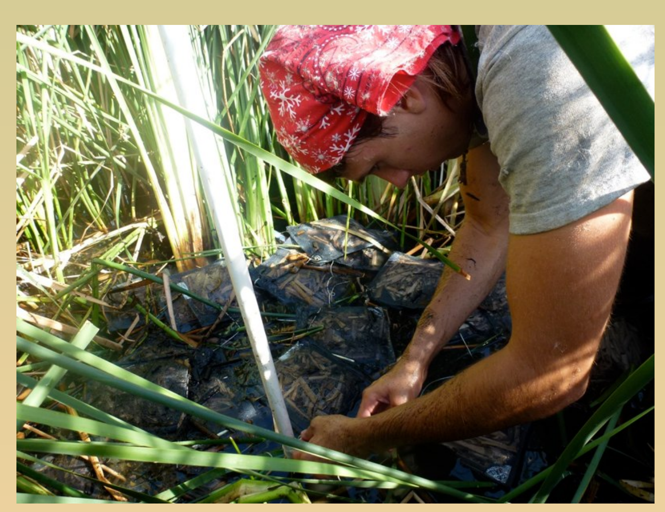
Figure 2B: Deploying litterbags in July 2012

Our preliminary analyses focus on comparing variance in % weight loss: a) within the vegetated marsh itself, along our marsh transects (Figure 3A); b) across the whole wetland ecosystem, or across our transects (Figure 3B), and; c) among our three plant morphotypes (Figure 3): 1. Our preliminary results show rapid weight loss in the first month of up to 25-30%. There is some early evidence that litter from the Schoenoplectus sp. morphotypes may be decomposing slightly faster than Typha sp. litter (see middle and lower panels in Figure 3 compared with top panels). 2. The first 3 months of data suggest that decomposition rates may be higher in marsh locations closest to the open water, compared with more interior marsh locations (Figure 3A). This is likely because the open water is the source of nutrients, and greater nutrient availability is expected to stimulate litter decomposition rates. 3. We found no evidence that initial decomposition rates are higher closer to the inflow point, suggesting that the inflow \rightarrow outflow nutrient gradient may be less important than the within marsh (water \rightarrow shore) nutrient gradient. 4. The first 3 months of litter decomposition data suggest that it is more logical to use our 3 locations along the transects as replicates and analyze decomposition rates using the transects themselves as experimental units.