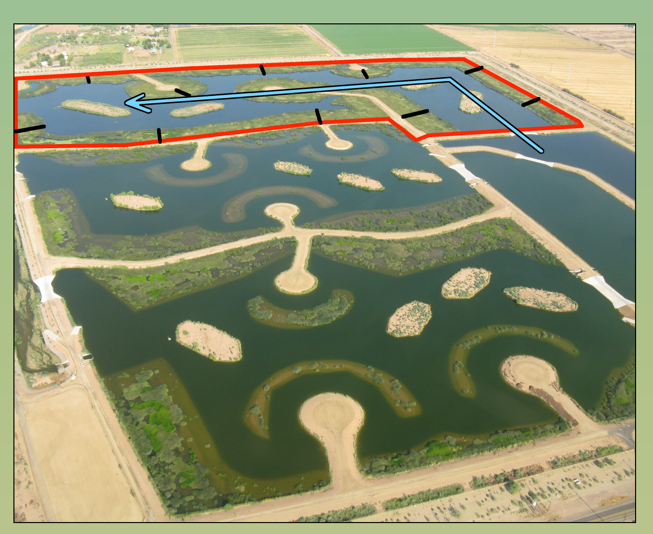
Figure 1A: Aerial photo of the treatment flow cell

The results we present here are preliminary, as the experiment began in July 2012 and will not be complete until late 2013. For this reason, in this poster we are using our preliminary data to address questions about the future statistical analysis of our results, including: How should we use our factorial design to best address replication in the Tres Rios treatment wetland ecosystem?