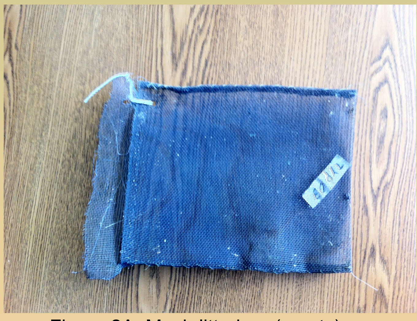
Figure 2A: Mesh litterbag (empty)