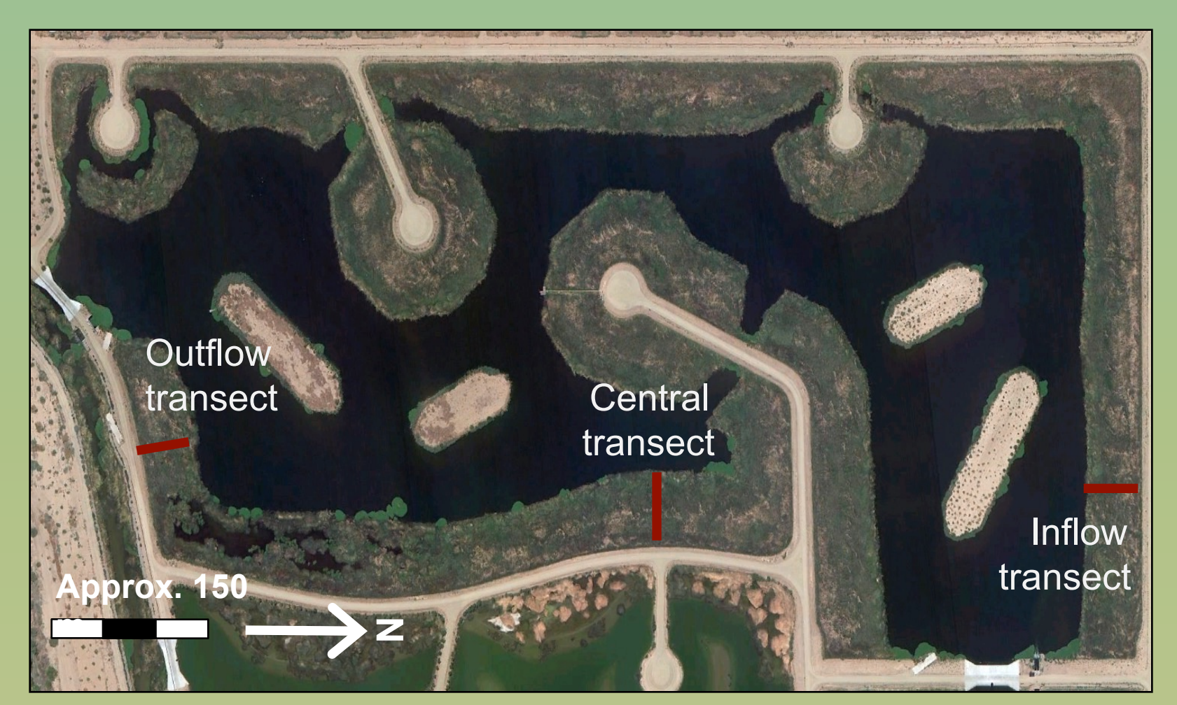
Figure 1B: Location of experimental transects