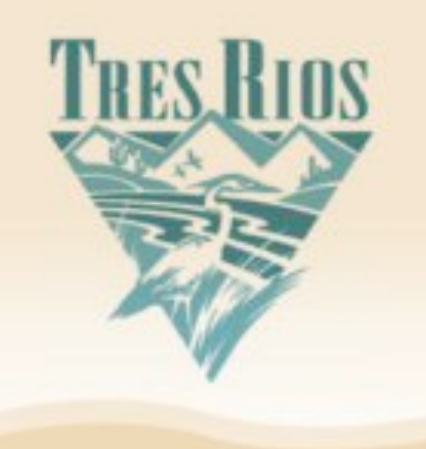
Figure 2. Location of Tres Rios constructed wetlands within Phoenix metro area. http:// phoenix.gov/TRESRIOS/faq.html

EPA. (1998). A Handbook of Constructed Wetlands. Washington, D.C.: EPA.