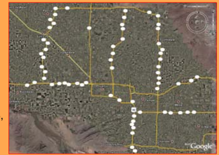
Fig. 1. Map of soil sampling locations in the Phx valley.

Soil samples were analyzed for soil properties and PAH concentrations. After sample preparation and cleanup methods, PAH compounds were identified and quantified with a GC-MS (Fig. 2). To date, 35 of 83 samples have been quantified.