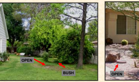
Figure 1. Examples of mesic and xeric landscapes with seed tray experiments. Red arrows point to seed trays either placed under a bush (protection from predation) or in the open (vulnerable from predation).