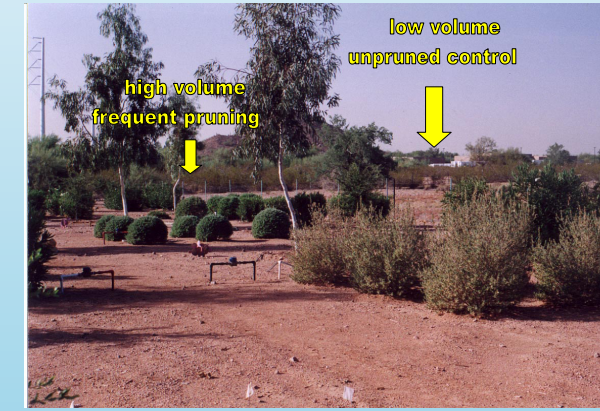
Figure 1. Example experimental plots. Shrubs in the foreground are low volume irrigation, unpruned control Texas sage (high WUE), and those in the background are Texas sage given high irrigation volume and pruned every six weeks (low WUE).