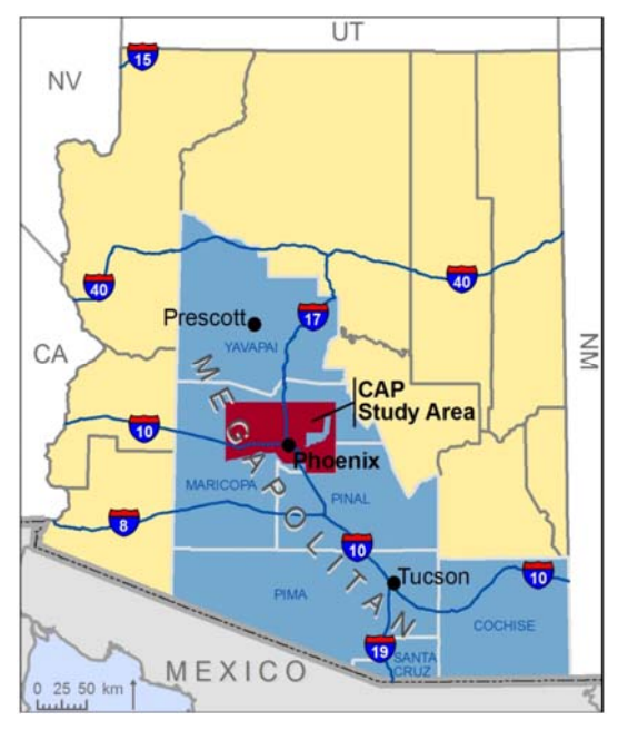
Figure 1. Map of Arizona, USA, showing extent of the Sun Corridor Megapolitan (blue shading) and the CAP study area within it (red shading). Gray lines are county boundaries.

The 6,400-km<sup>2</sup> CAP study area in central Arizona incorporates metropolitan Phoenix, surrounding Sonoran Desert scrub, and rapidly disappearing agricultural fields (Fig. 1). Rapid urbanization has been the dominant land change since the 1950s, accompanied by an order-ofmagnitude increase in population. Coincident with rapid population growth, the rise of automobile transportation has led to air pollution and other